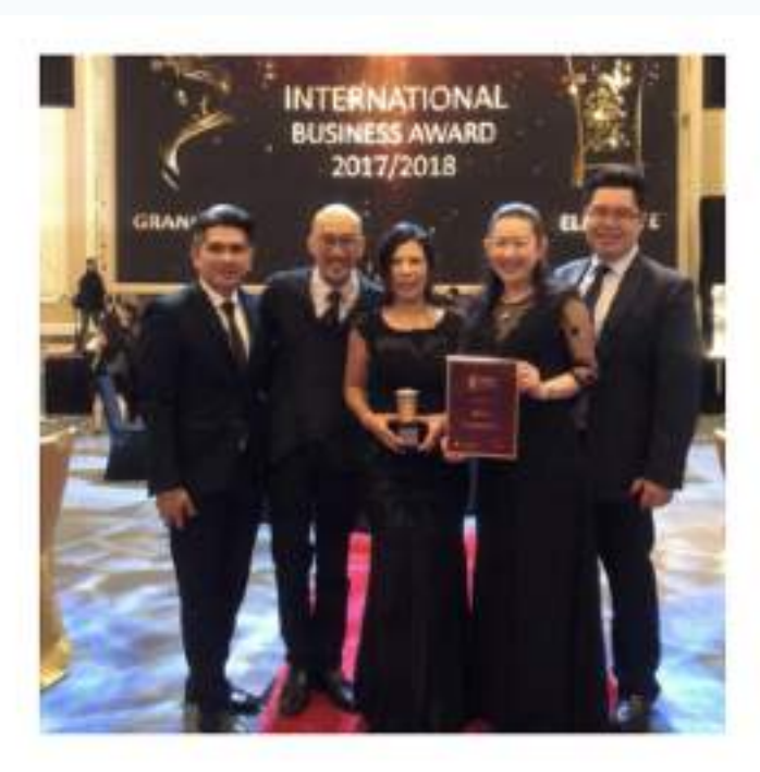
International Business Award 2017/2018