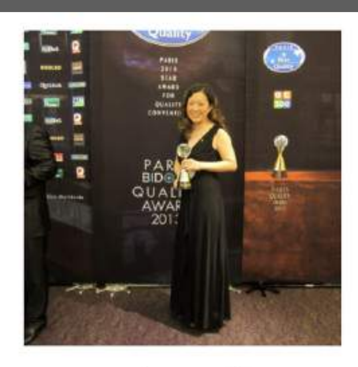
Paris Quality Leadership Award 2013