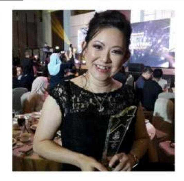
The Star Influential Individual award 2017