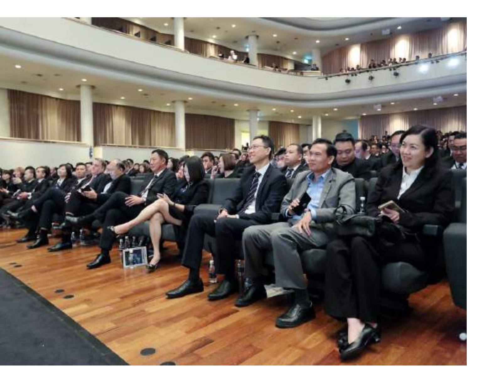
Eager Learner at Various Trainings