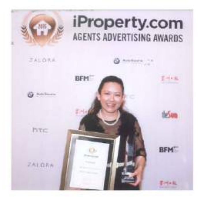
Iproperty Innovative Real Estate